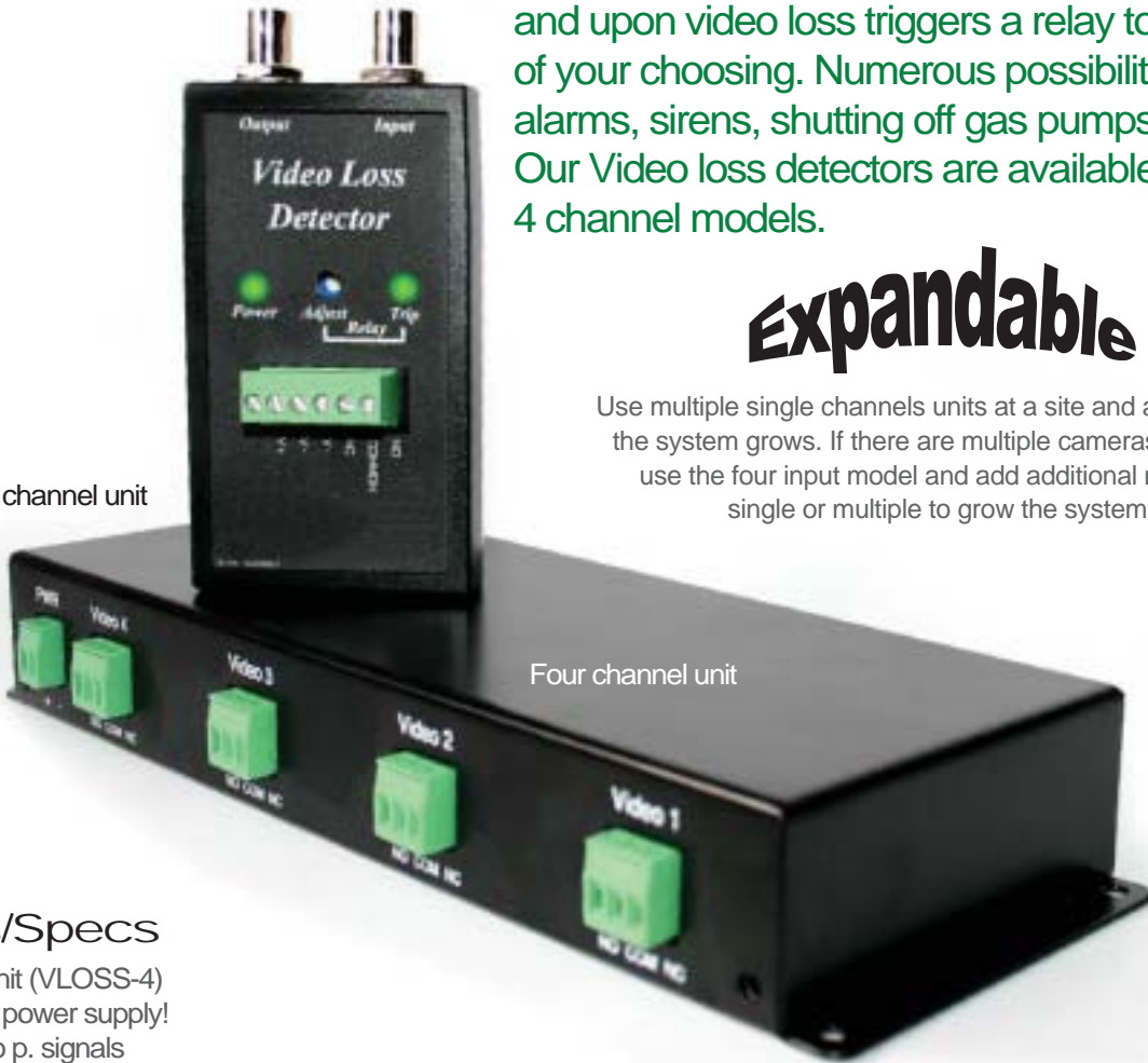
Four channel unit